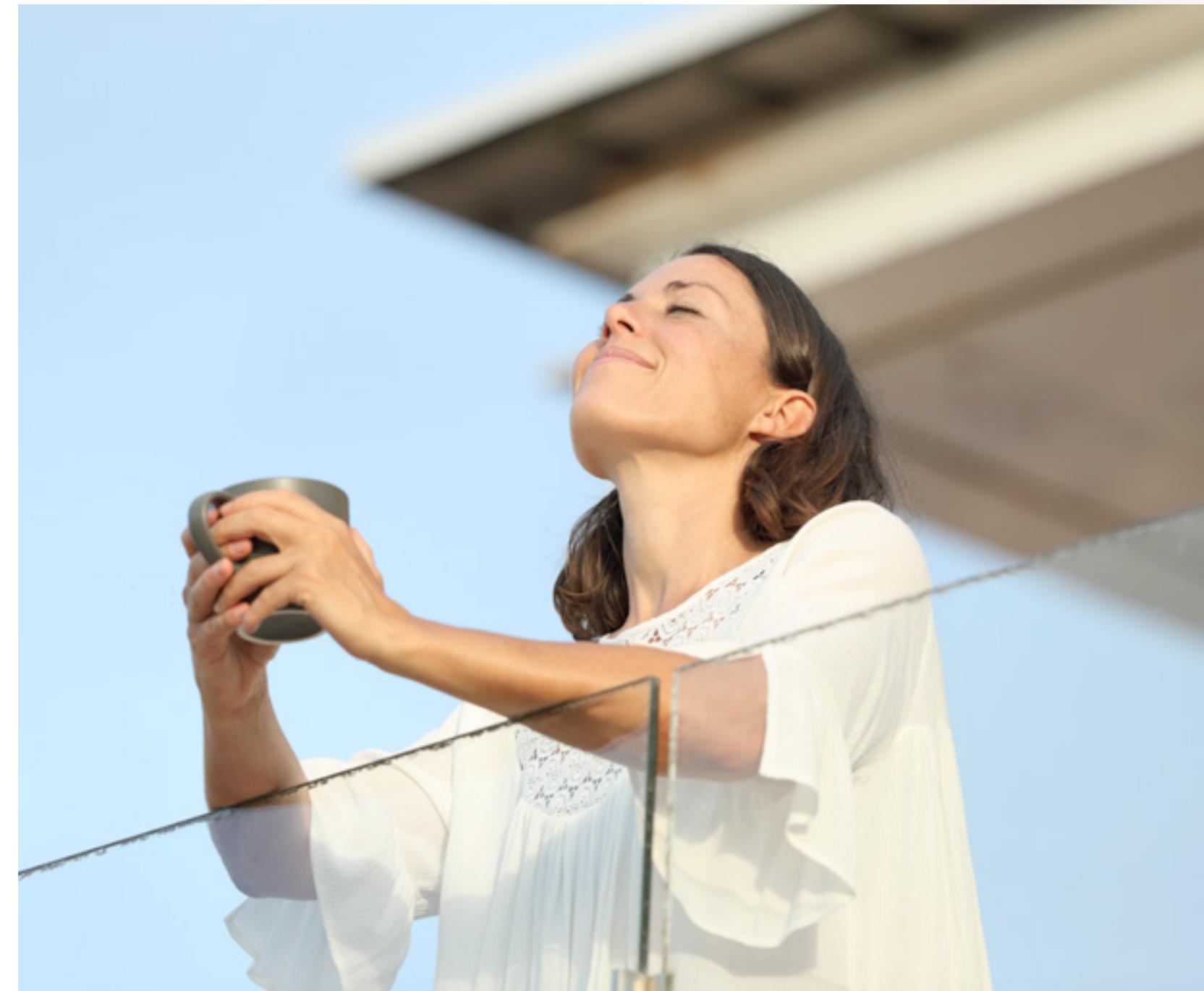
Sun shading elements (balconies & perforated panels)

Extensive landscaping with native plants or adaptable species enhances the property's beauty and value while reducing its environmental impact. Other environmentally friendly features include advanced waste management and water reuse solutions, as well as a bicycle storage area and EV parking to encourage residents to use less traditional combustion engines.